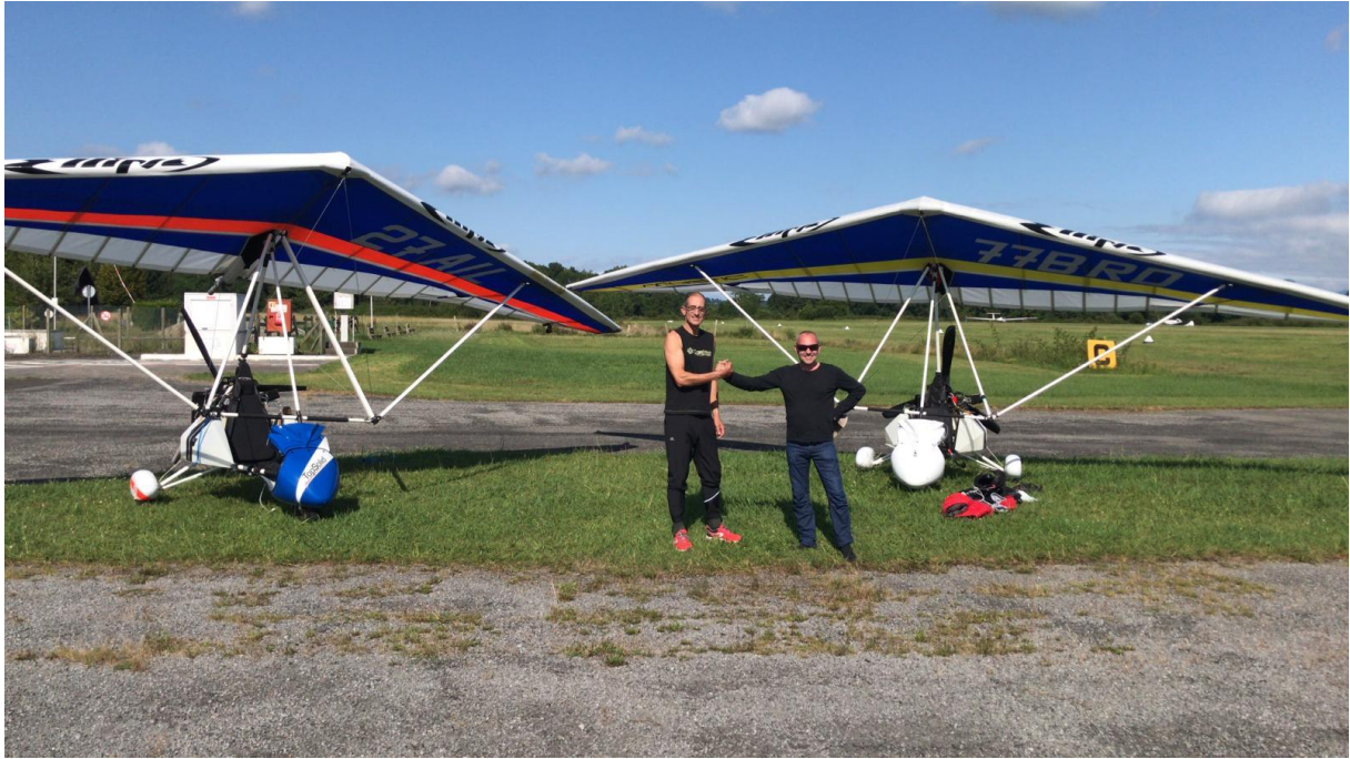
Arrival at Oloron-Herrere.